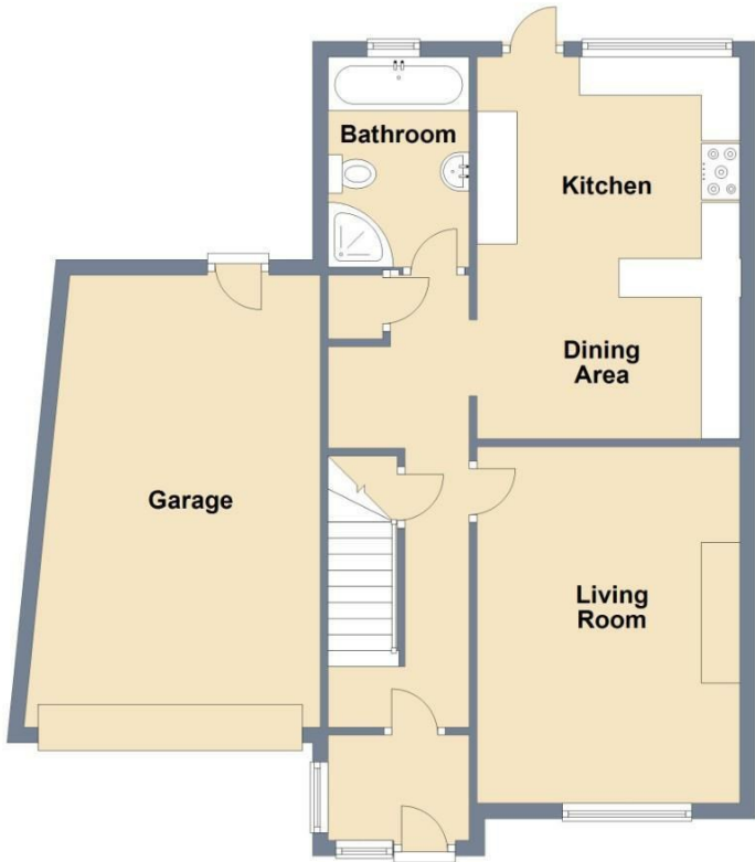
Ground Floor Approx. 74.4 sq. metres (801.3 sq. feet)